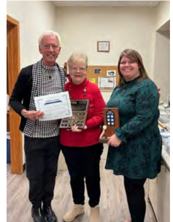
Awards presented for First Presbyterian Church of Port Huron from Habitat for Humanity.