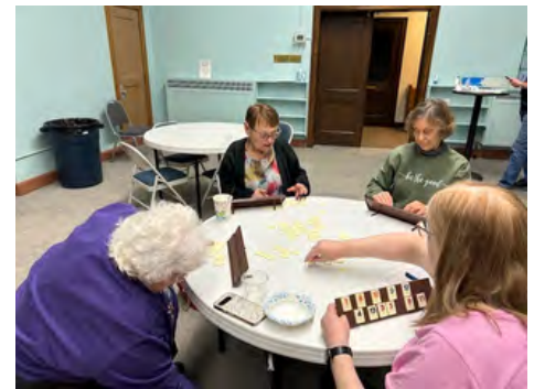
About 20 people joined in for the first of three game nights!