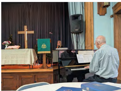
Worship in the Fellowship Hall.